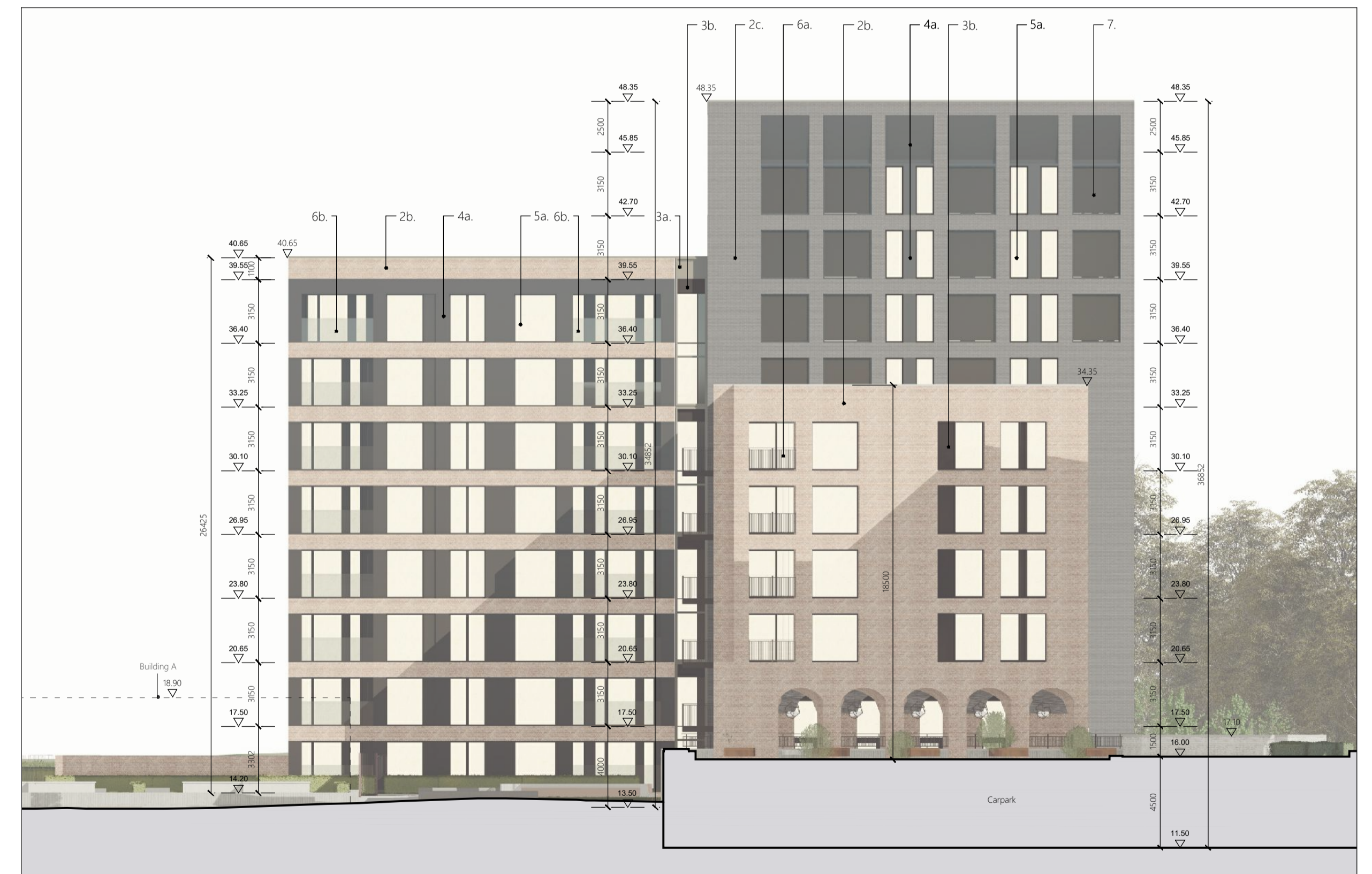
4 BUILDING B: SOUTH ELEVATION B4 SCALE 1:200