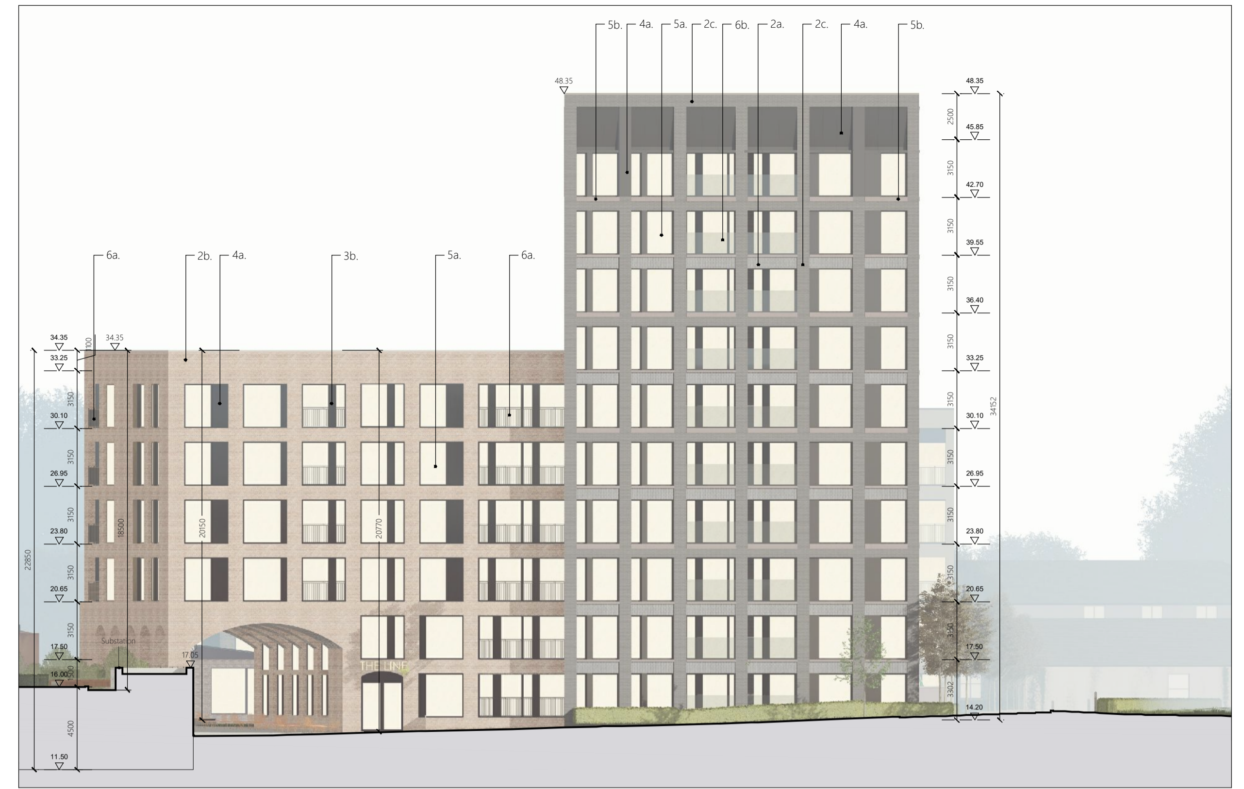
2 BUILDING B: EAST ELEVATION B2 SCALE 1:200