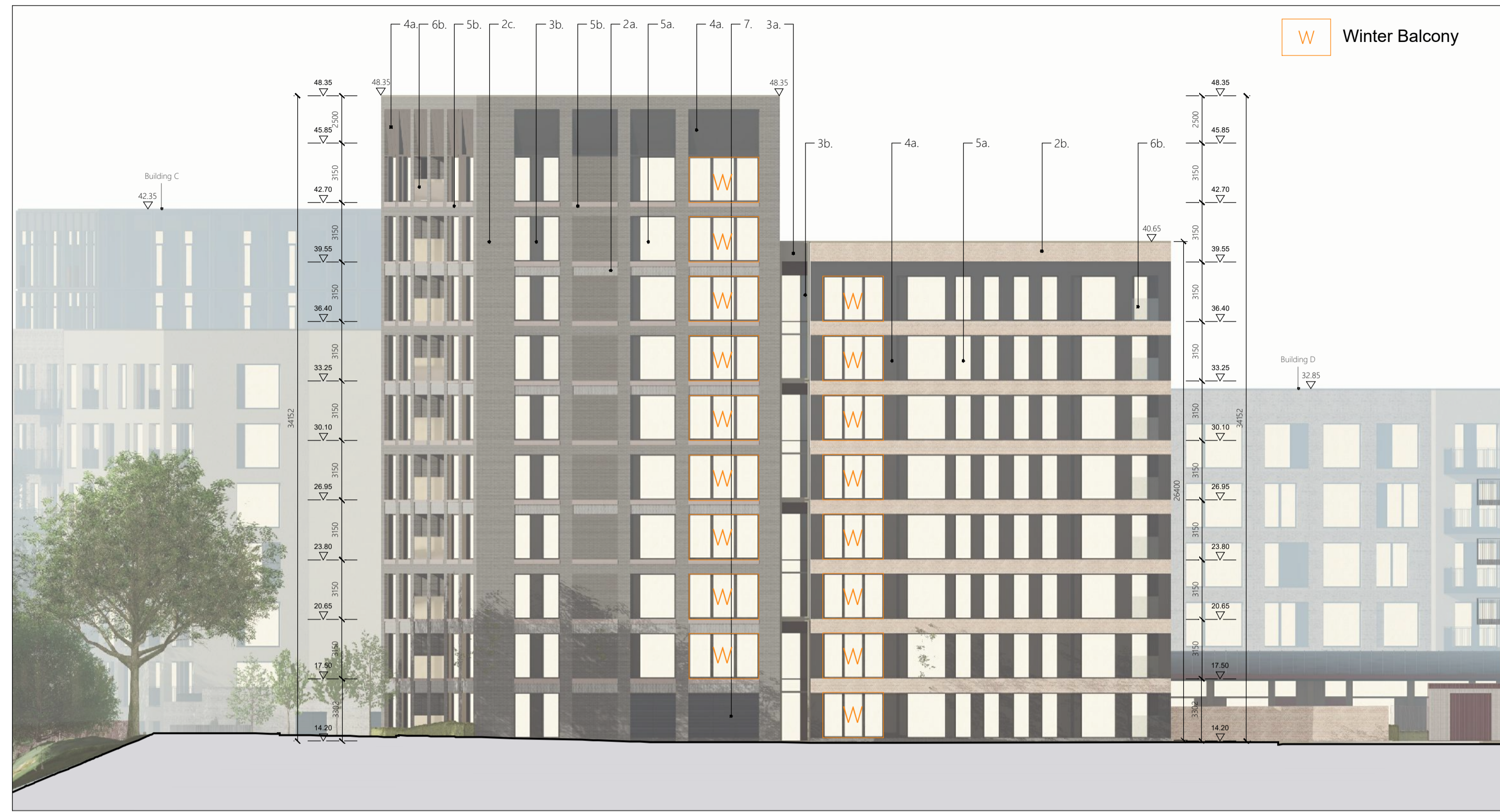
1 BUILDING B: NORTH ELEVATION B1 SCALE 1:200