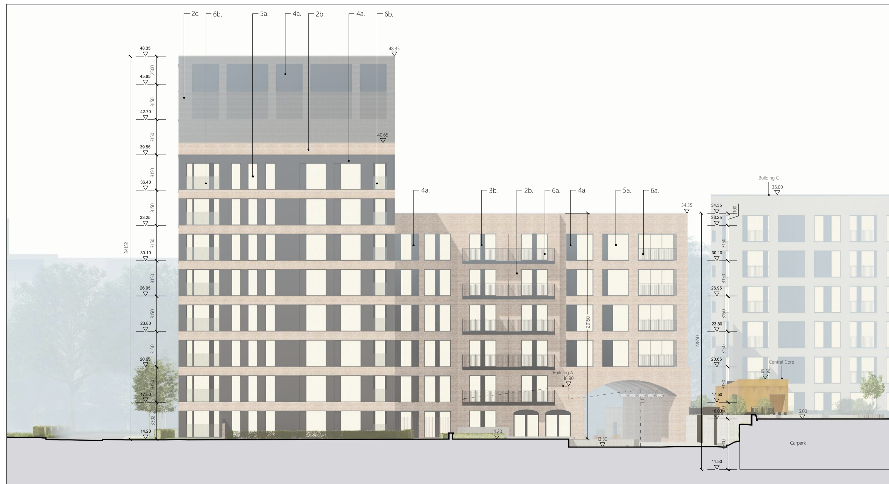
3 BUILDING B: WEST ELEVATION B3 SCALE 1:200